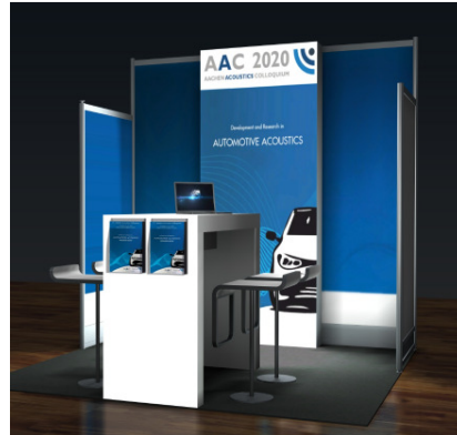
Illustration shows optional equipment and other graphics.

Stand area: 2.5 x 2 m = 5 m 2 max. total height 248 cm Stand construction: system, supports/frames Aluminium silver Wall fillings: hardboard, 4 mm, white LED frame: H = 248 cm, W = 98 cm